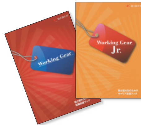
Career support handbooks for Kokushikan students: Working Gear (for third-year students) and Working Gear Jr. (for first-year students)

job offers. The center provides diverse support for job hunting, and staff members are always on hand to help students who have anxieties or concerns about their job-hunting activities.